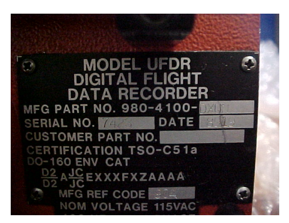
Figure 3. A view of the flight data recorder recovered from the aircraft.

The aircraft was equipped with a Honeywell solid state flight data recorder part number 980-4100DXUN, serial number 7423. The unit was undamaged and there was no apparent impact damage to the ULB, which remained attached to its bracket. The unit showed no signs of external damage.