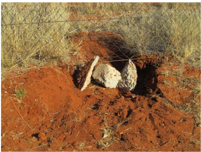
Figure 10. A substantial hole that was previously closed up and then dug open again.