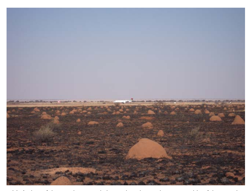
Figure 14 . A view of the termite mounds located on the north-western side of the aerodrome.

At the time the investigating team visited the aerodrome again, being 5 August 2010 several of the areas were still not subjected to any burning (still grass covered). It could however, be seen from the photo that there was indeed a serious termite mound population within the boundaries of the aerodrome property. It was noted during the visit in question that the aerodrome licence holder had indeed commence with a program whereby they had obtained the services of a contractor to start demolish these termite mounds by making use of earth moving equipment.