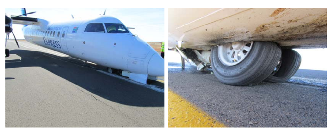
Figure 1. A view of the aircraft as it came to rest on the runway with the nose gear collapsed backwards.

1.3.1 The aircraft sustained substantial damage to the nose landing gear and lower nose fuselage structure.