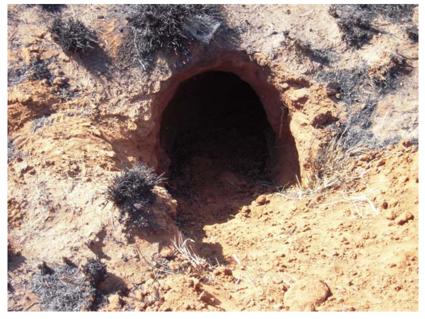
Figure 15. The photo displays one of many animal holes/shelters on the aerodrome property.