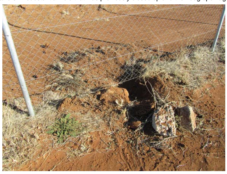
Figure 9. A substantial hole that was previously closed up and then dug open again.