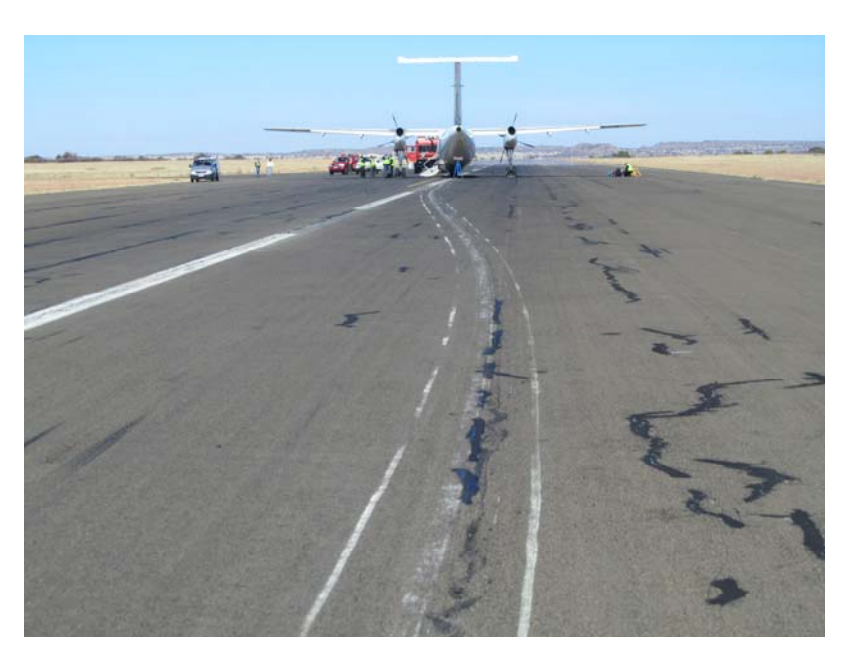
Figure 4. A view of the nose gear strut assembly and the gear doors scraping on the runway.

The pilot managed to keep the nose of the aircraft up for a further 479 m past the point of impact. Although both nose wheel tyres were found to be deflated, there was a clear blowout on the right nose wheel tyre some 400 m past the point where the nose gear had first made contact with the runway surface. Fourteen (14) m past the tyre blowout marking, both nose gear doors started making contact with the runway surface, followed by the nose gear strut assembly some 186 m further on. The aircraft came to a halt on the runway centre line 1 838 m past the threshold of runway 20.