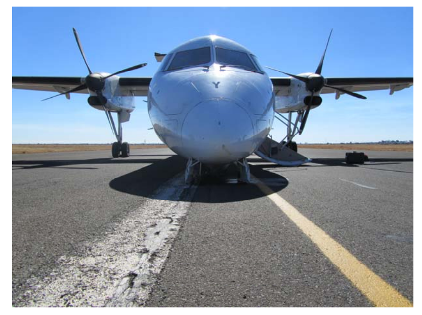
Figure 5. Final position of the aircraft as it came to rest on the runway centre line.