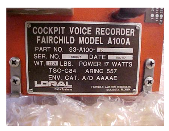
Figure 2. A view of the cockpit voice recorder recovered from the aircraft.

The cockpit voice recorder (CVR) was recovered from the accident aircraft. The CVR was a Fairchild Model A100A, part number 93-A100-80 and serial number 60867. An external examination of the CVR revealed that overall it was in a good condition. The underwater locator beacon (ULB) or pinger was undamaged.