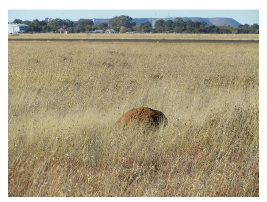
Figure 13. A general view of the aerodrome property with runway 02/20 in the background.

During an inspection of the aerodrome property it became apparent that hundreds of termite mounds were located on the property. According to a senior aerodrome official they had had a programme in place to try to address this issue, whereby they physically broke down the mounds and filled it with poison; however, this programme ceased some time ago. A substantial number of these mounds were observed in the area around the runways. With termites being the staple diet of an animal like the aardvark/anteater, the animals most probably found their way onto the aerodrome property by digging holes underneath the fence to feed on the food supply available. The photos on the next page display the environment before the grass was burnt and the second photo after the grass was burnt on the northwestern part of the aerodrome property.