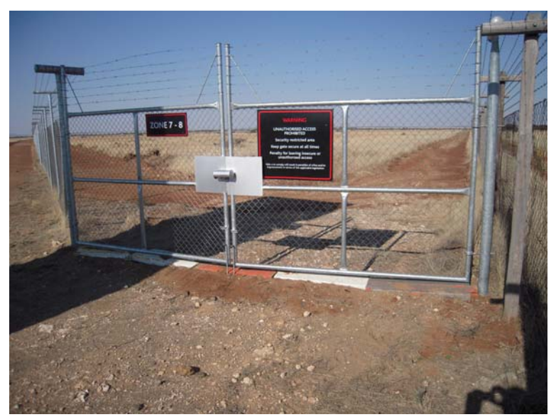
Figure 12. Access gate within the perimeter fence with solid concrete foundation.

It was noted that one of the perimeter fence access gates had a solid platform that consisted of concrete blocks. This practice was however, isolated to this gate only. See photo below.