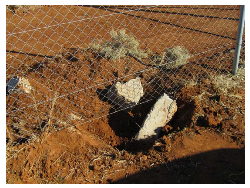
Figure 8. A substantial hole that was previously closed up and then dug open again.