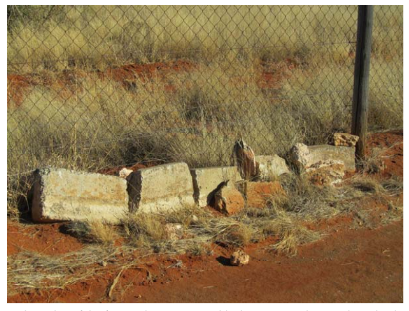
Figure 7 . A section of the fence where concrete blocks were used to restrict animal access.