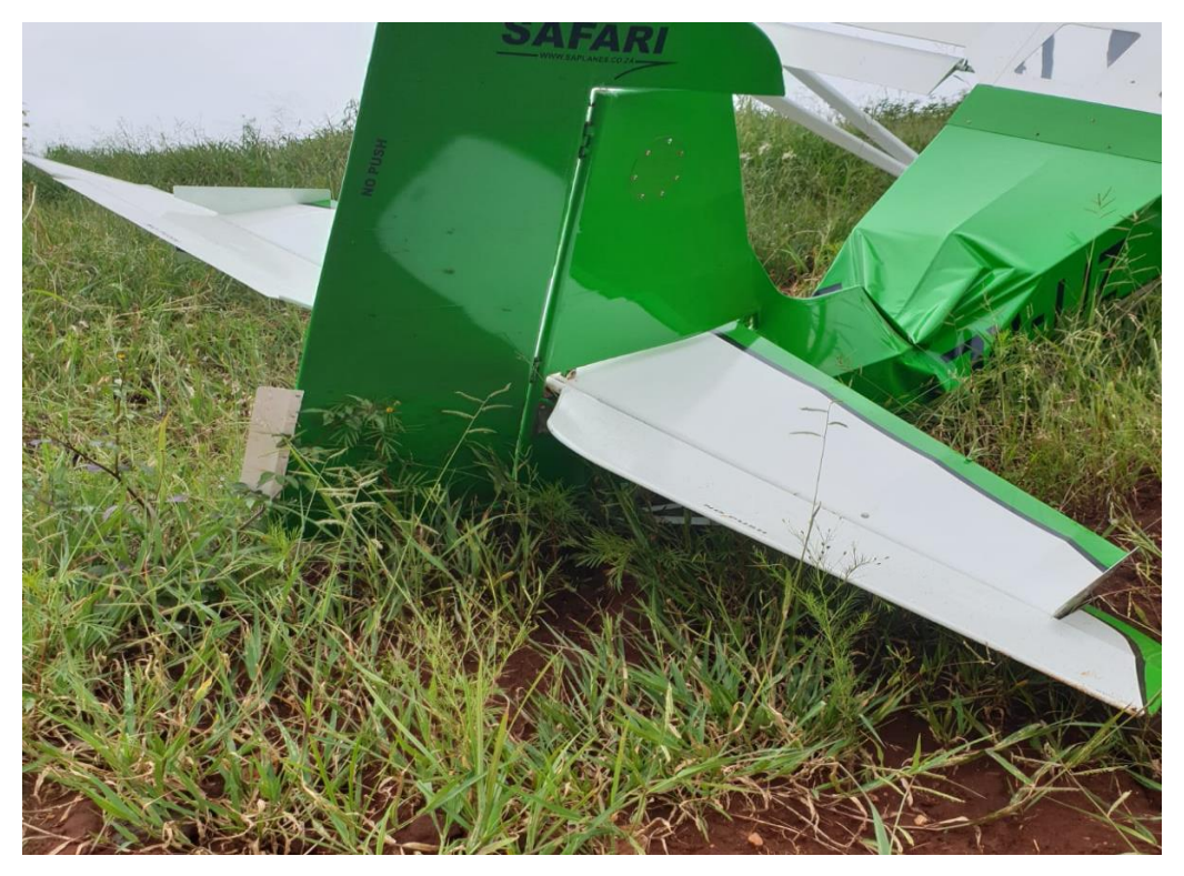
Figure 4: Damage to the tail section.