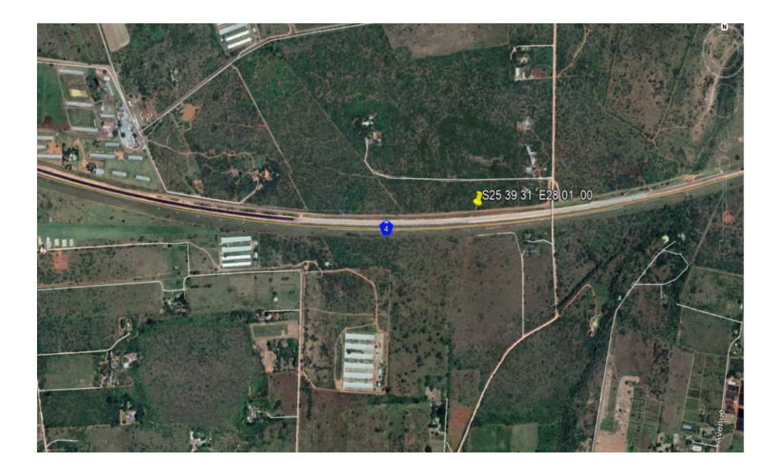
Figure 1: An aerial view of the accident site.