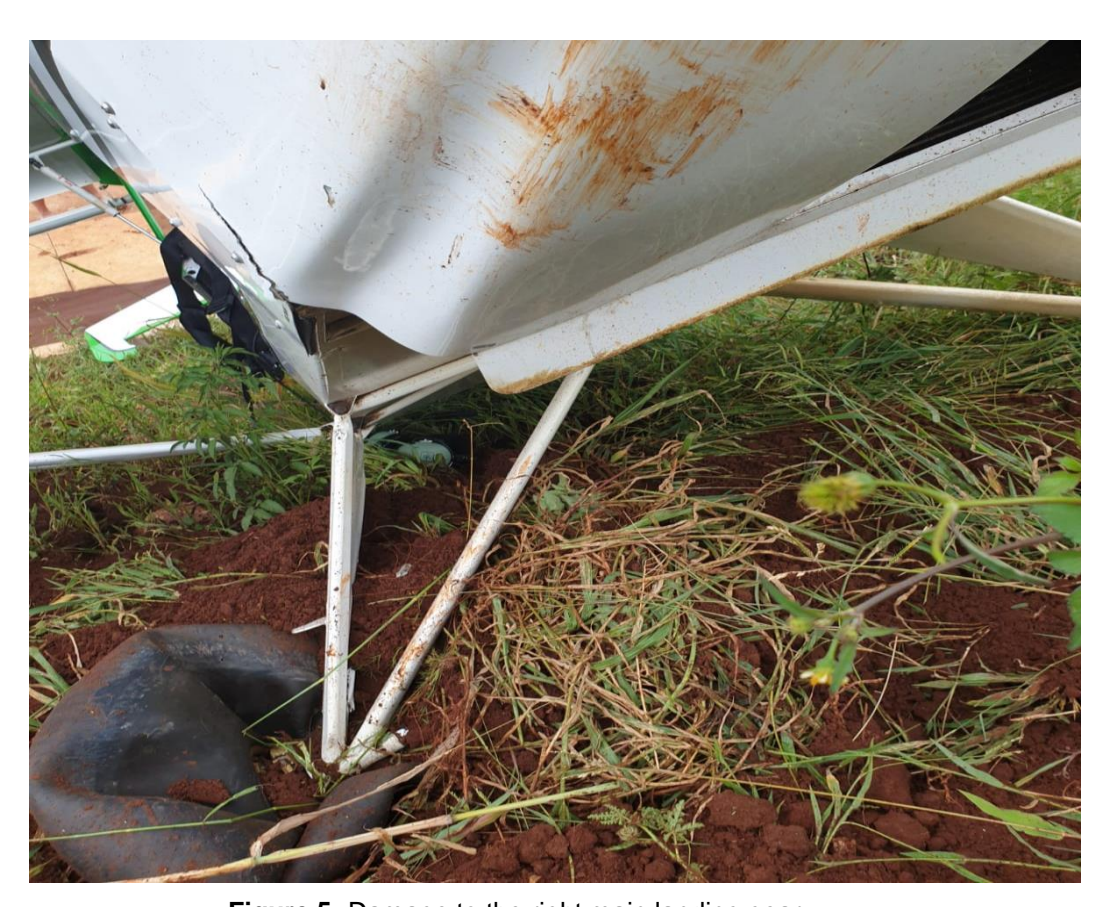
Figure 5: Damage to the right main landing gear.