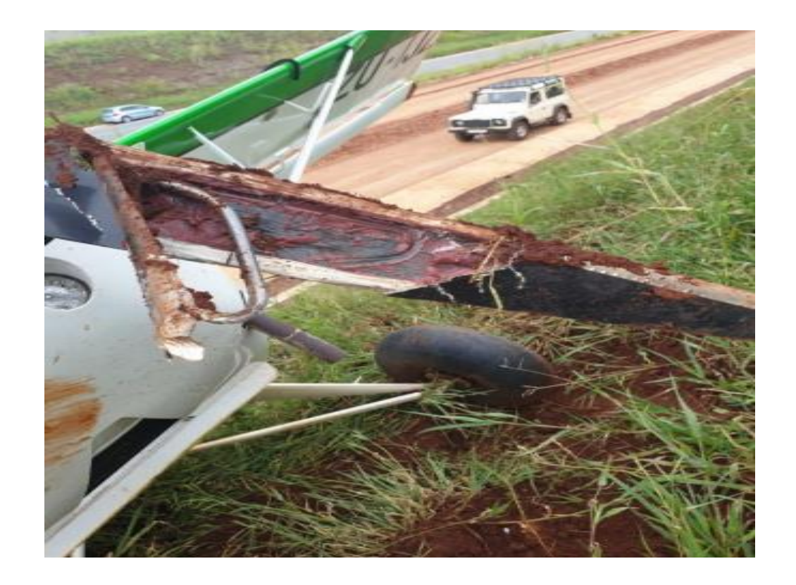
Figure 2: The aircraft post-accident.