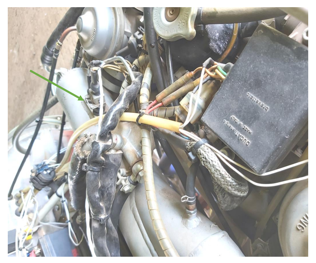
Figure 7: Green arrow shows airbox pressure sensor.

The third possibility, which is more likely, is that the fuel pressure regulator had failed, resulting in less fuel in the engine.